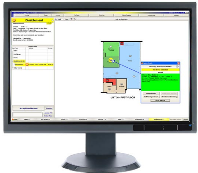
Guide Repeater user interface