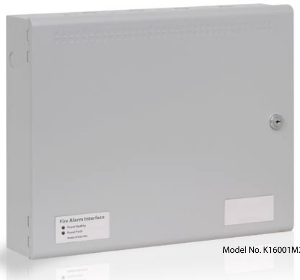
Model No. K16001M2