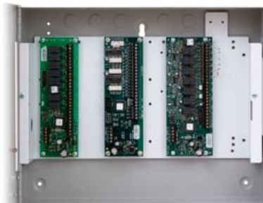
3x I/O boards without PSU